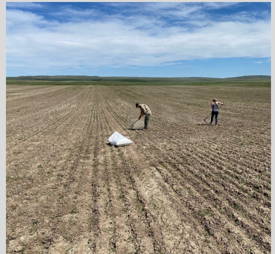
Seeding winterfat and silver sage near Manyberries, AB

This ACA project will provide 1,280 acres of habitat for mule deer, sage grouse, pronghorn and many other keynote species in the southeastern part of Alberta. The land acquired by ACA in partnership with other organizations currently consists of a mix of native and tame grassland along a riparian area and cultivated cropland. The plan is to restore the cropland to native grassland which will provide habitat for a variety of species. This was the first year of work on this land, and 300 acres were reseeded to native grass with an oat nurse crop. This land will provide critical habitat as well as an area of hunting opportunities for ungulates and upland game birds.