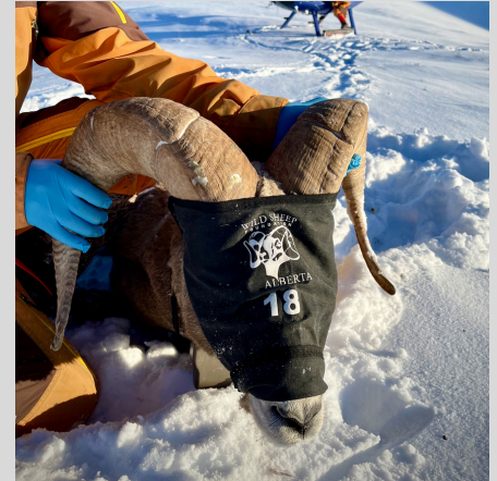
A bighorn ram is ready for release in southwest Alberta after being GPS-collared and ear-tagged for an ongoing study on bighorn ram movement and disease risk.