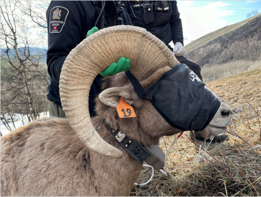
A Conservation Officer supports a ram's head to keep its airway open while it recovers from being chemically immobilized for GPS-collaring and collection of biological samples in Sheep River Provincial Park, near the site of the 2023 Mycoplasma ovipneumoniae outbreak.