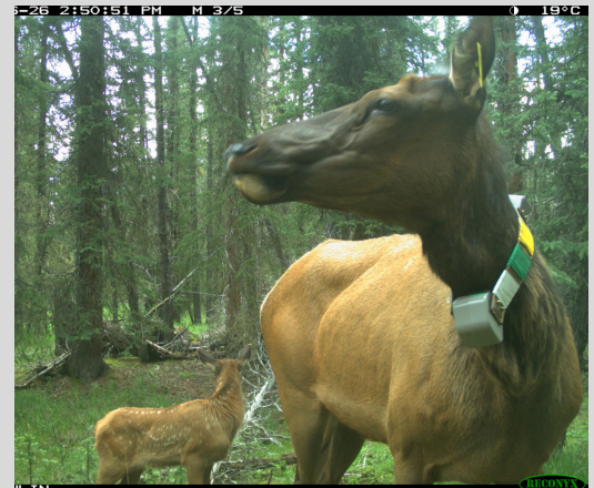
Ya Ha Tinda Elk Research Project

Assessing the Effects of Disease on Western Alberta Elk project begins with testing historic blood samples for diseases of interest. The original blood samples were taken from Ya Ha Tinda elk populations dating back to 2002. The samples are now being tested for diseases that were not tested for previously, but may have affected the health and success of the Ya Ha Tinda herd. This data will allow assessment of the effects of predation on the health and ecosystem dynamics of the Ya Ha Tinda elk population.